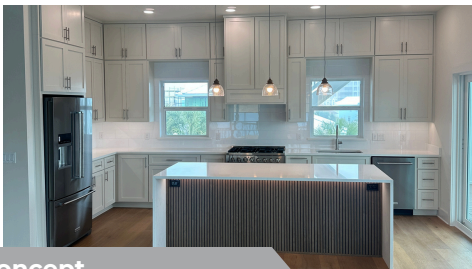
Open Concept Chef's Kitchen